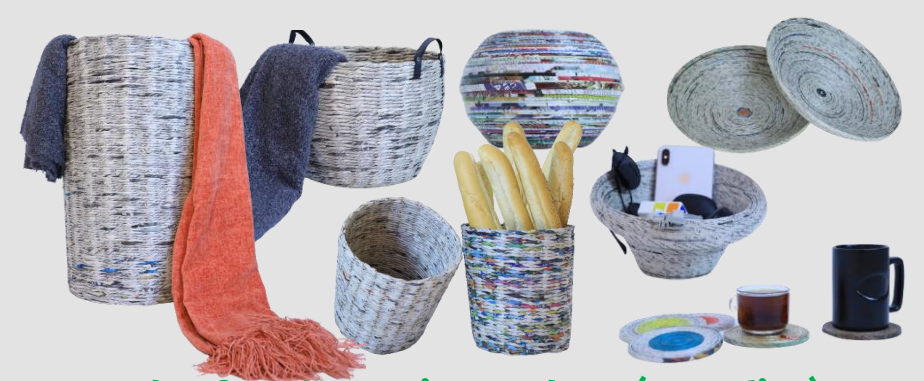
Handcrafted decorative products (Upcycling)