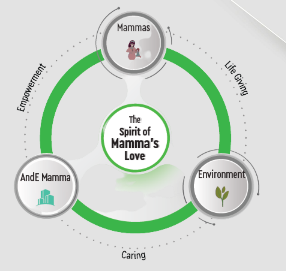
Eco-Social Business Organization