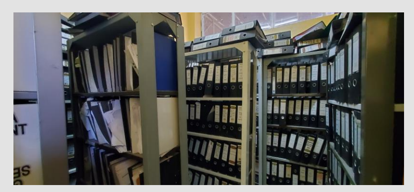
Secure Document Destruction